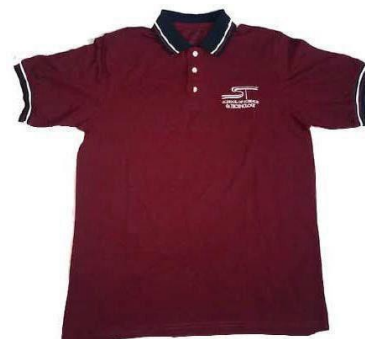
Uniform top for K-5